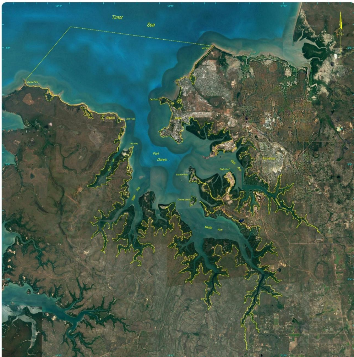
Figure 1 – Darwin Port Limits

This Port Notice applies within the gazetted port limits of the Port of Darwin as detailed in figure 1.