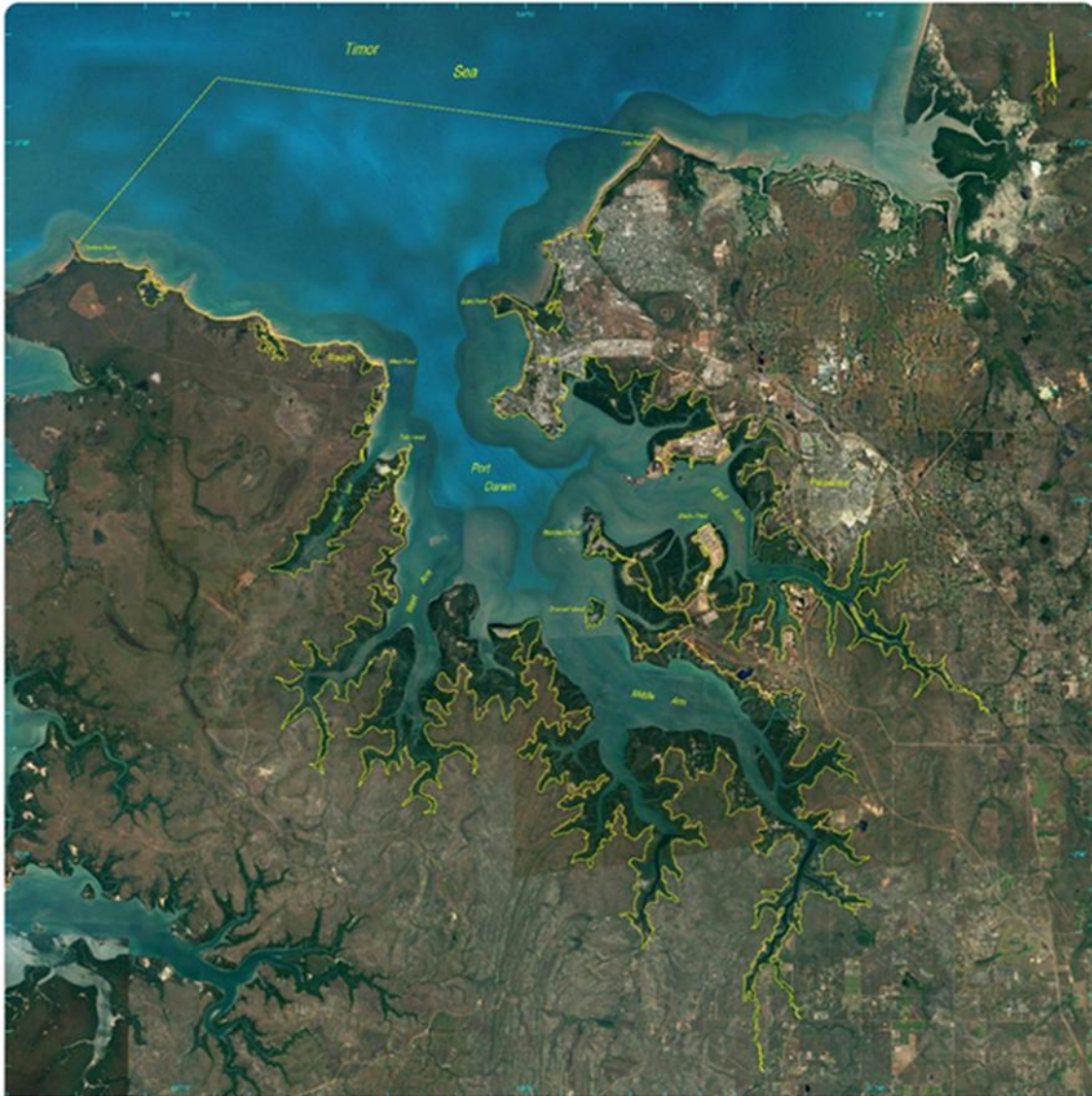
Figure 1: Darwin Port Limits

This Port Notice applies within the gazetted Port of Darwin as detailed in Figure 1.