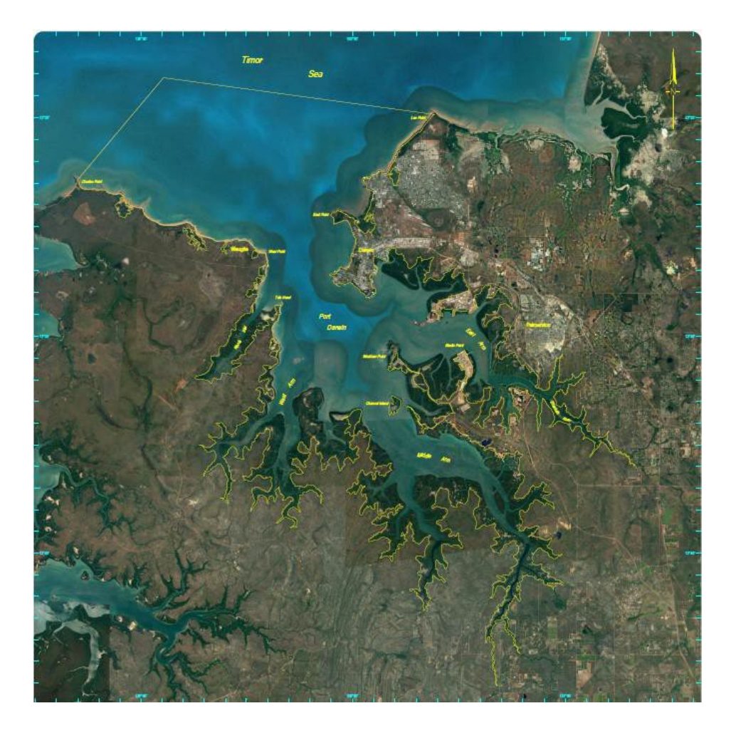
Figure 1 – Darwin Port Limits

This Port Notice applies to pilot embarkation and disembarkation within the gazetted Port of Darwin limits as detailed in Figure 1.