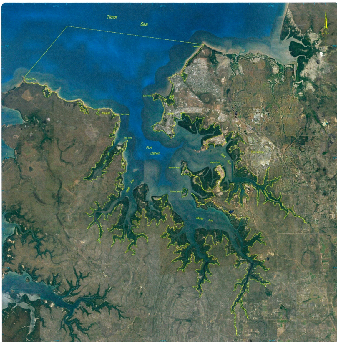
Figure 1 – Darwin Port Limits

This Port Notice applies within the gazetted port limits of Darwin as detailed in figure 1.